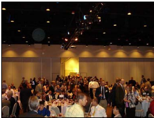
A packed banquet room at the Transportation Supersession in Tampa, FL.

"We all need to be looking at innovative and cost-effective ways to deliver projects of great value with fewer resources."