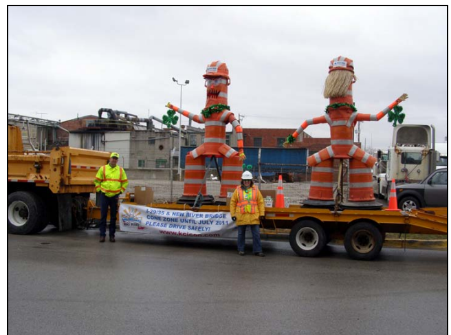
(Top) Michelle Zuck with Vocational Services Inc. adds labels to bags of candy corn, handed out at the NKC Snake Saturday Parade. “Cone Zone 2010” labels were affixed to 2,200 bags of candy.